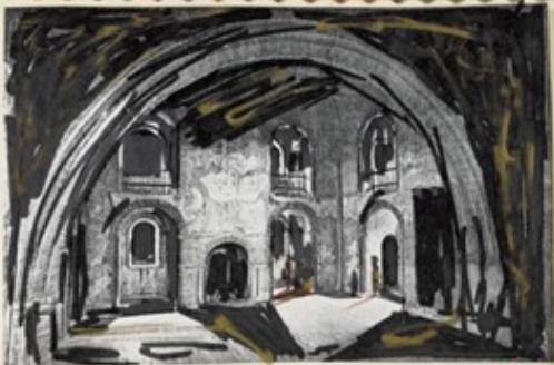
+ Exchange of gifts

Throne Room gave my return very public the King in his throne but brother Kent and Courtiers